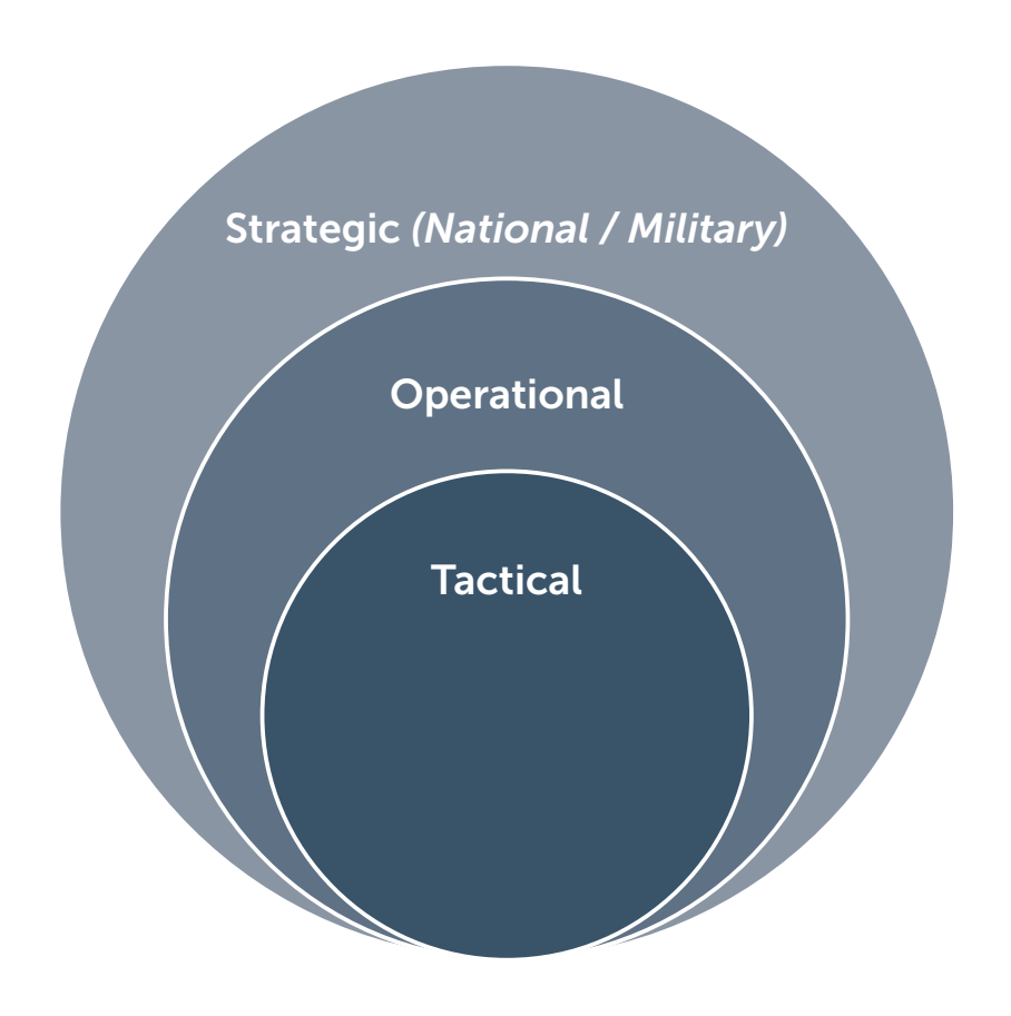
Figure 1: Levels of military operations<sup>104</sup>