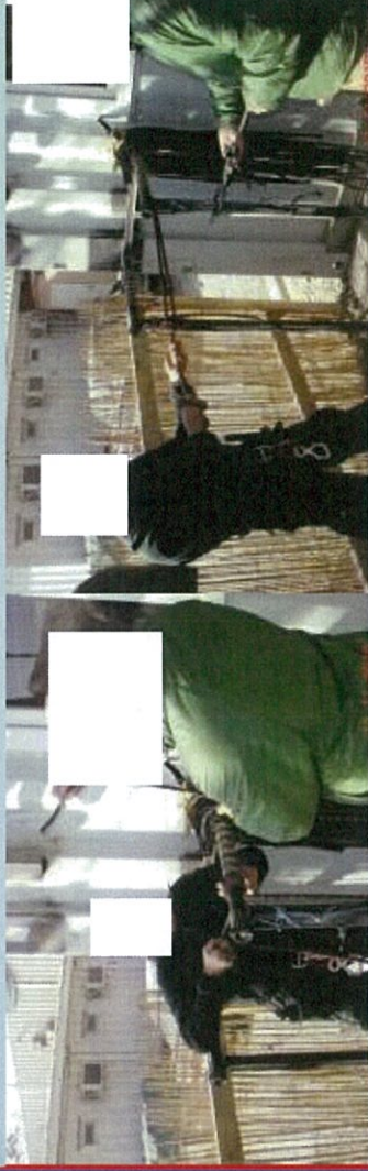
TRAIN THE TRAINER SESSION ON RELEVANT RAPPPELLING KNOTS