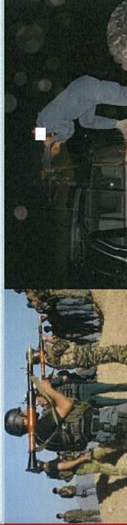
B SQN CRU UNDERTAKES WEAPONS SYSTEMS REFRESHER TRAINING