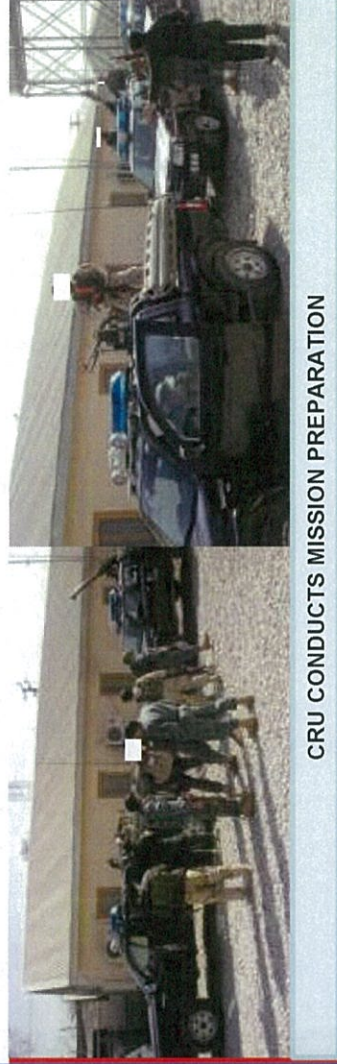
CRU CONDUCTS MISSION PREPARATION