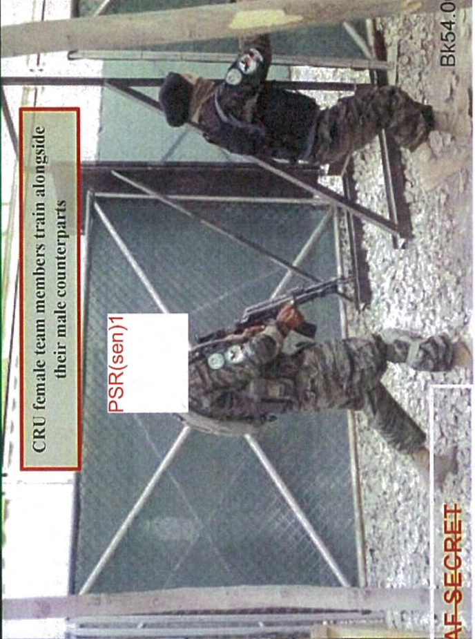
CRU female team members train alongside their male counterparts