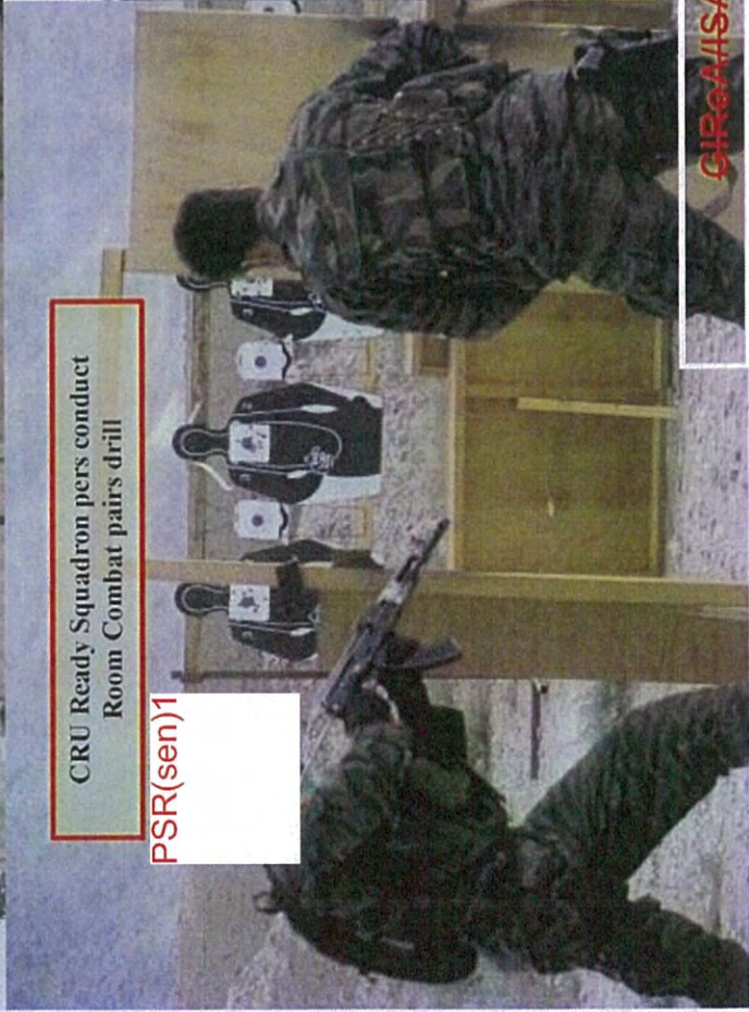
CRU Ready Squadron members conduct Room Combat pairs drill