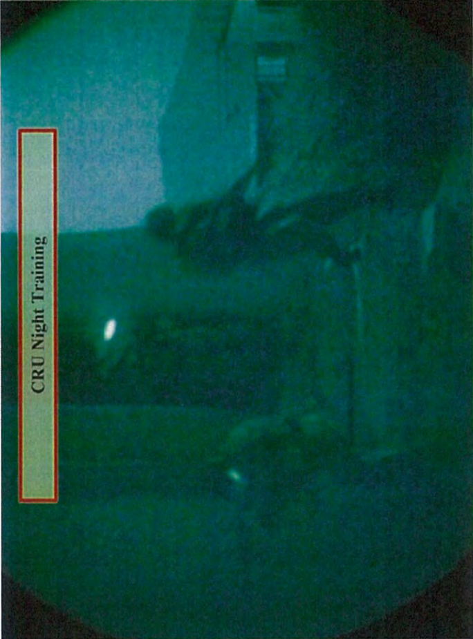
CRU Night Training